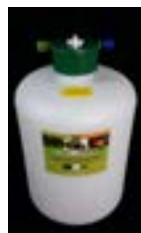
2030HB, 11.4 liter