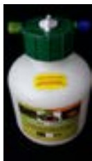
2005HB, 2.8 liter