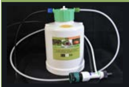
Out of the box, assembled