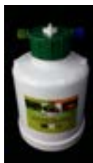
1010HB, 3.8 liter