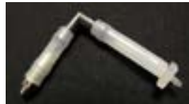
liquid adapter, fit when using liquid fertiliser