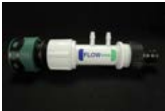
Hose tap adapter